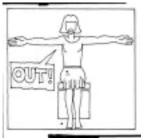
SHUTTLE IS OUT