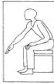
SHUTTLE IS IN